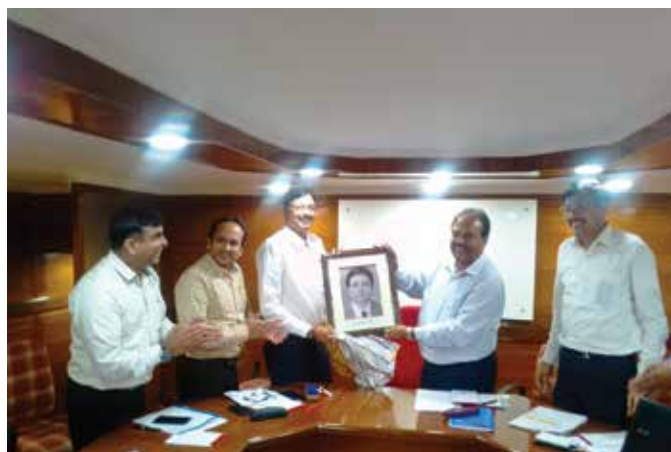
Past President Photograph Added in Compass Office