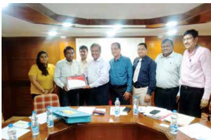
New Members Awarded Certificate

With the ongoing changes in Statutory rules and regulations changes in the country, members were regularly communicated on statutory circulars and updates.