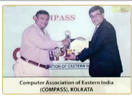
Computer Association of Eastern India (COMPASS), KOLKATA